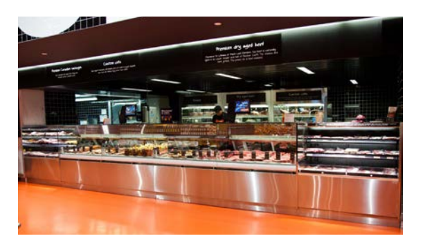
Unique design ensures uniform case performance, lower average product temperatures and meets DOE 2012 standards for energy efficiency.